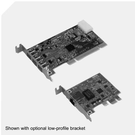
Shown with optional low-profile bracket

Family of Gigabit Ethernet NICs and IEEE 1394b adaptors.