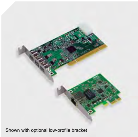
Shown with optional low-profile bracket

Family of Gigabit Ethernet NICs and IEEE 1394b adaptors.