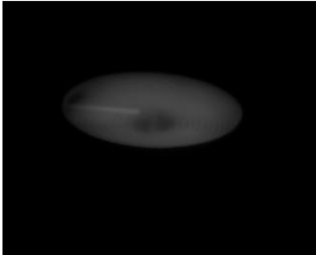
Glass ceramic cooking plate imaged with XEVA InGaAs camera

Picking out defective glass products the hot end of the process, while the temperature is still above 200 °C, is particularly interesting for glass manufacturers. At that stage, rejects are identified, then shunted aside and reprocessed efficiently, greatly reducing scrap. Unlike thermal cameras, short SWIR cameras can image through glass, allowing operators to inspect both the interior and exterior walls of the bottle, as well as monitor the temperature uniformity and cooling rate of the material.