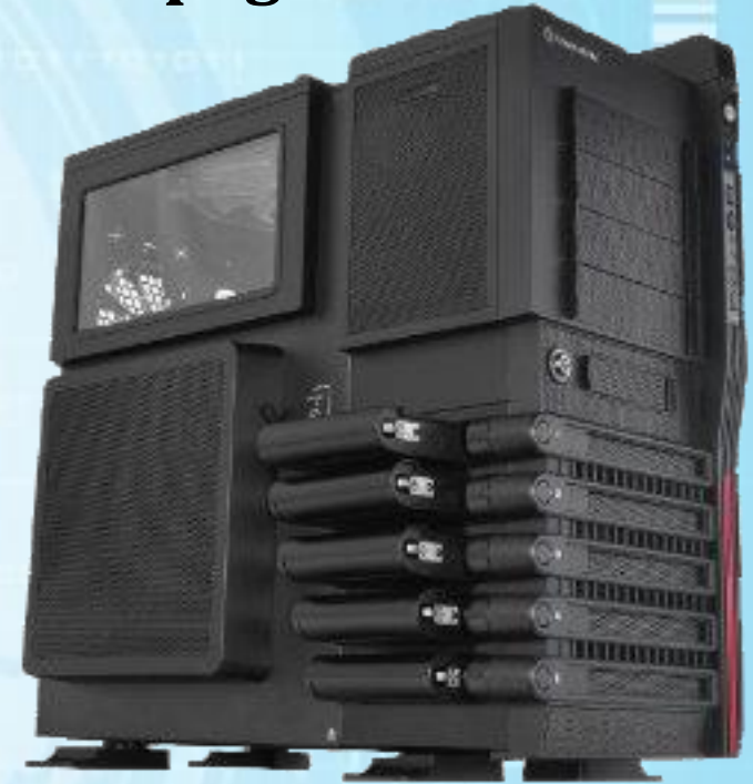
Computer equipped with DVR recorders

Four high resolution line scan cameras secured to an airport gantry on a motorized track capture high resolution images of cracks on the airport runway. The images are relayed to a computer with DVR recorders to store and analyze the data. The use of cameras allow for easy, effective, automated detection of cracks for repair.