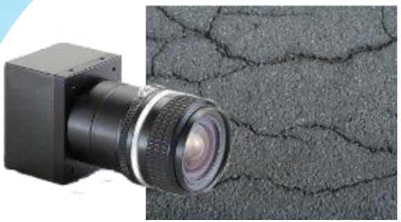
High resolution image of crack captured by line scan camera