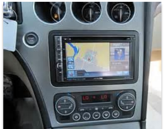
Inside the truck there is a computer equipped with DVR recorders and GPS location technology. The Computer is linked to a monitor which is viewable by the driver to assist in the crack detection.