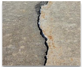
Crack propagation captured by the cameras.