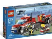
Packaging and print inspection