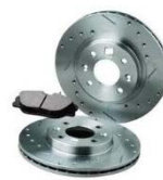
Automotive body & part inspection