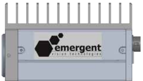
Side View Dimensions