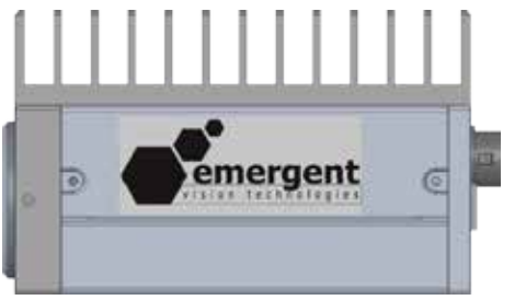
Side View Dimensions