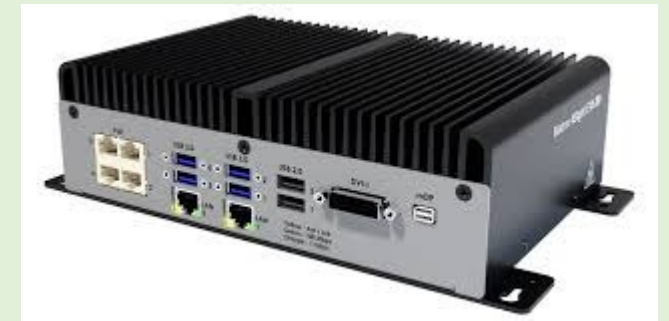
Matrox 4Sight EV6 Vision Controller